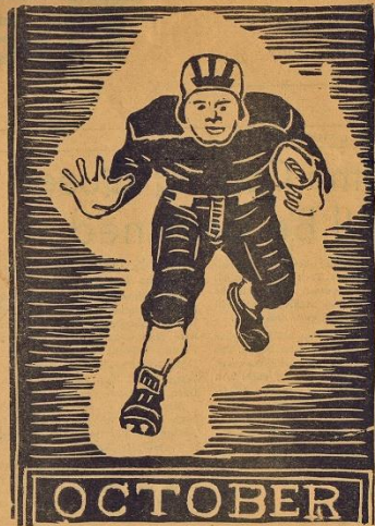
Rah rah rah football is here Let's all support it with a great big cheer; Come on boys, let's win each game And bring Tech High greater fame.